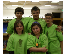
Fear Factor 2008 winners. Teen programming has been successful. One of the most popular programs is Fear Factor.