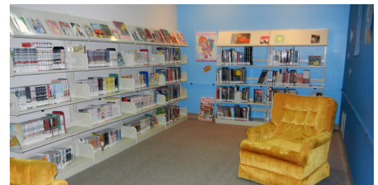
New Graphic Novel Room @ the Rawlins Library