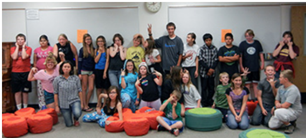
Teens that completed the Summer Reading Program enjoyed being locked in the library overnight.